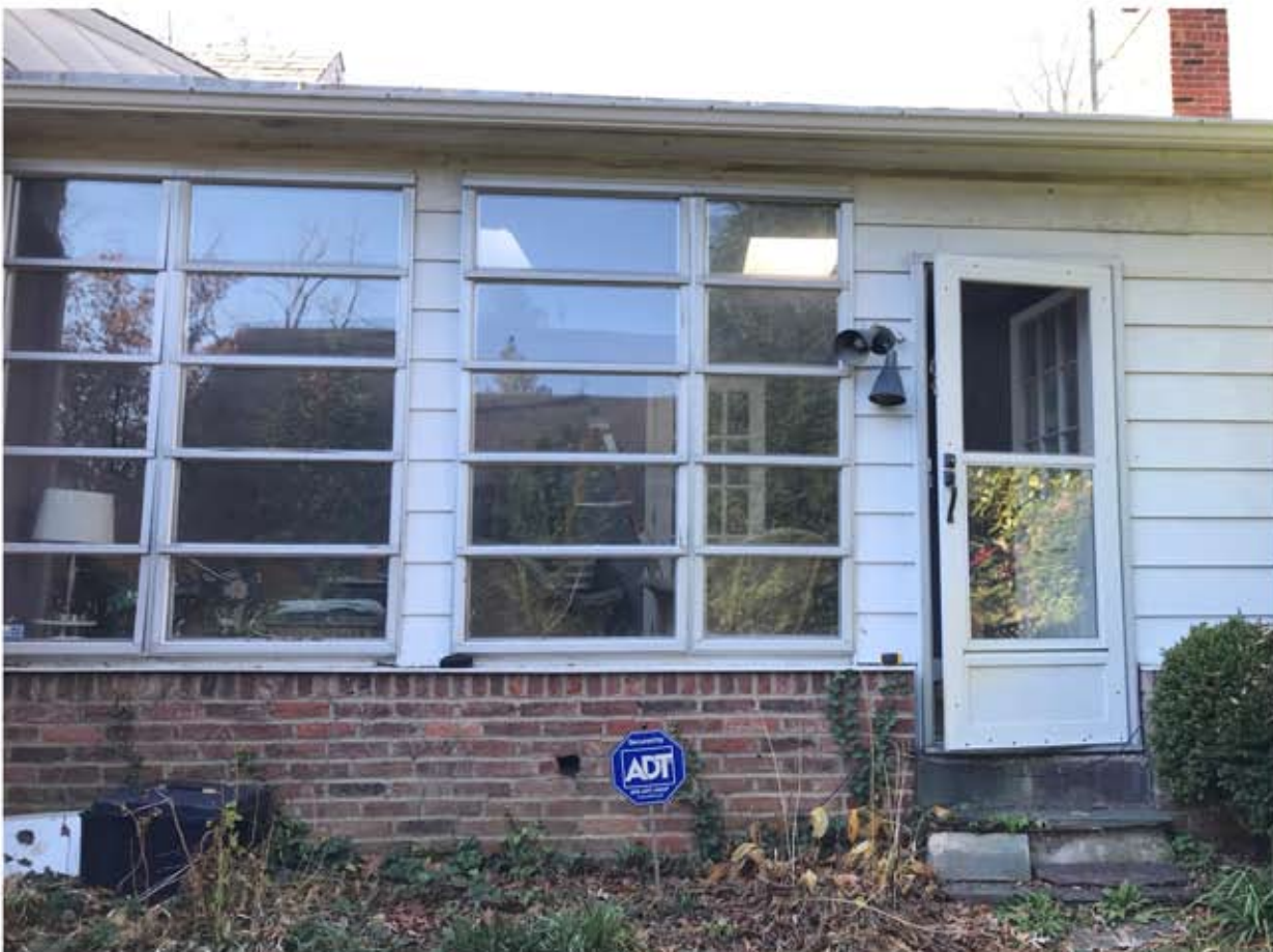
Exhibit 1: PHOTOS EXISTING CONDITIONS