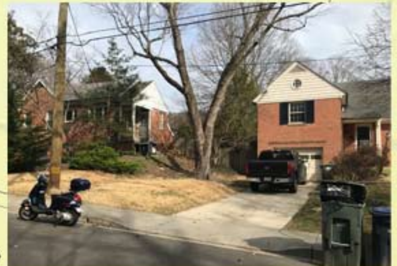
Exhibit 3: SIGHT LINES